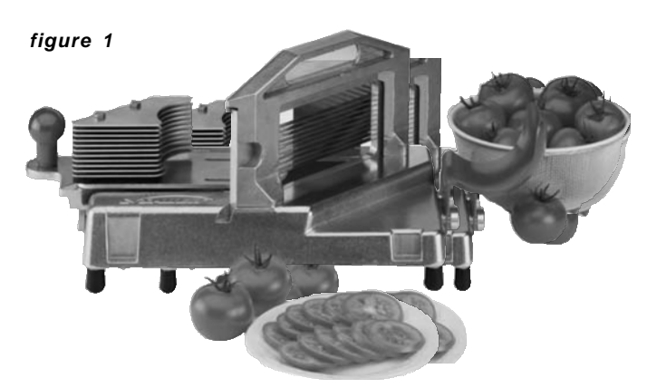
IMPORTANT: Make sure thumbscrews on blade cover are tight before dicing.